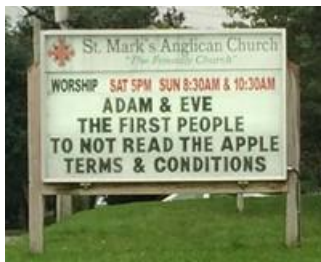
Creative Church Notice Board