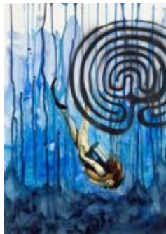
A Community Centred and Saturated in Prayer