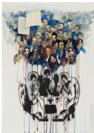
Community that lives as a sign of the kingdom