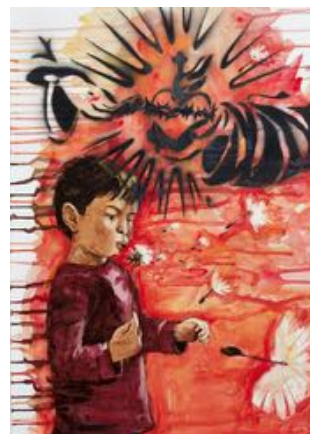
Mission always alert to issues not only of need but also of justice

We then had a brief presentation on New Monasticism . This is a rather loosely defined movement within modern Christianity inspired by some, but not all, of the features of earlier monastic movements including prayer,