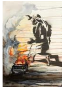
Worship that enables people to face themselves and the reality of the world in the presence of God